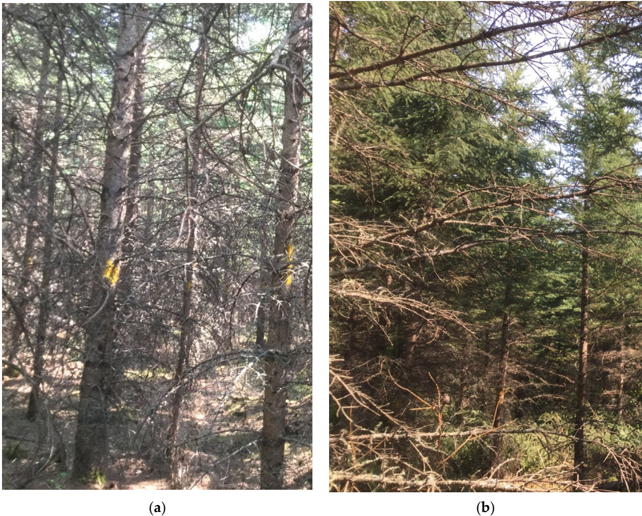
Figure 3. Commercially thinned white spruce stands in northern Alberta in July 2020 (a) unthinned ( \sim 10,000 stems \text{ha}^{-1} ) and (b) thinned to 1500 stems \text{ha}^{-1} .