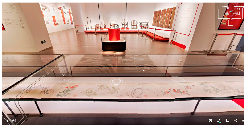
Figure 2. Nanjing Museum virtual exhibition hall. https://www.4dkankan.com/spg.html?m=KJ-VtBBey2zrMe (accessed on 17 December 2023).

The survey was divided into two parts. The initial segment gathered fundamental details, familiarity, and impressions of virtual art exhibitions. The second segment delved into six measurement constructs, namely CON, PU, AE, EE, SAT, and CI. Each of these constructs was operationalized using multiple items on a 7-point Likert scale, where 1 indicated “strongly disagree” and 7 indicated “strongly agree”. The questionnaire’s measurement items (see Appendix A) were sourced from previous research and modified to suit the virtual art exhibition research project. Specifically, three items of CON were taken from [23], four items of PU from [83,84], six items of AE from [24,71,72], and five items of EE from [25,72]. Additionally, the three items of SAT were sourced from [22,85], and the three measurement items of CI from [24,86]. The researchers conducted a pretest and reviewed the revised measurement items before surveying visitors (Appendix A).